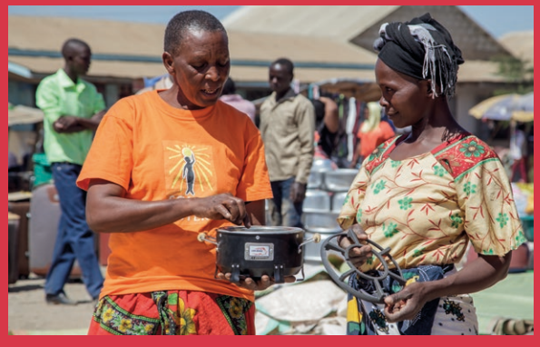
A 'Solar Sister' selling energy efficient cooking stoves at market.

Solar Sister's mission is to eradicate energy poverty by empowering women with economic opportunity. The organization combines the potential of clean energy technology with a women-centered direct sales network to bring light, hope and opportunity to even the most remote communities in rural Africa.