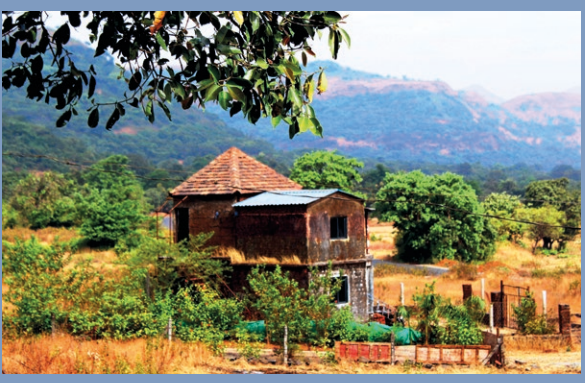
Landscape on the route of the Mumbai Trailwalker event