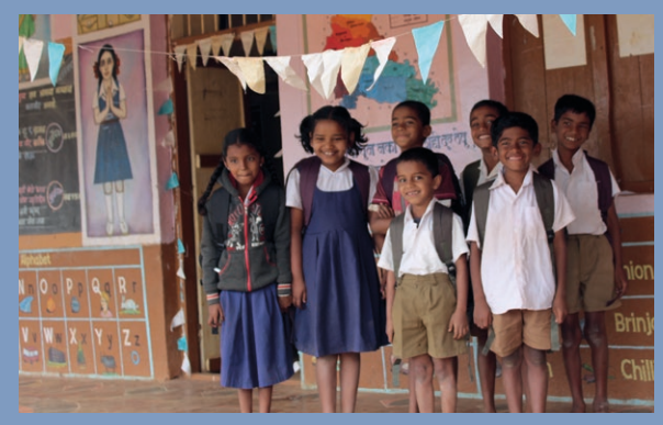
Local children on the route of the Mumbai Trailwalker event.

ERM employees have also worked with Oxfam in Australia to support local Trailwalker fundraising events in Melbourne, Sydney, Perth, and Brisbane.