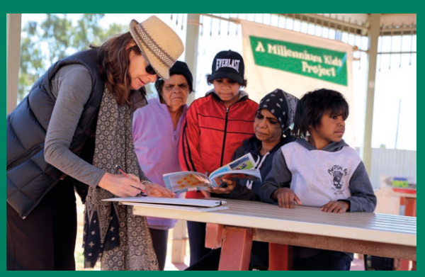
Millennium Kids 'On Country' program, Western Australia.

Millennium Kids is run by young people for young people in response to their demand to have a say about their environment and planet. This is achieved through partnerships that empower young people to explore, identify and address key environmental challenges and make change in their communities.