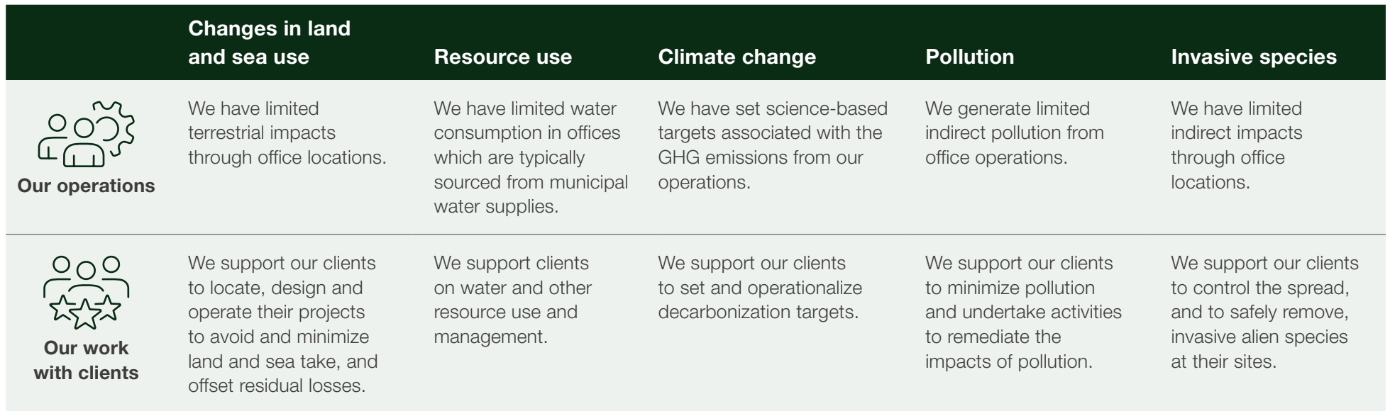
Table 1. Identification of pressures for ERM 1

We work with clients in more than 150 countries each year. Whether in their offices and other operations or conducting field work on and around greenfield sites, our activities for clients include helping them identify and manage their pressures (drivers of nature change as defined by the Taskforce on Nature-related Financial Disclosures) across the four realms: Land, Freshwater, Ocean and Atmosphere.